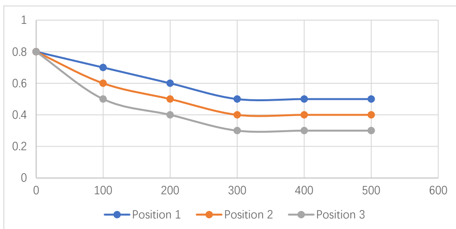
Figure 1. Trend of Virtual Reality Error Reduction

Digital VR technology is a highly interactive human-computer technology, which can simulate human's visual, auditory and dynamic behaviors in the natural environment. It has a wide range of applications in the field of simulation due to its unique characteristics of immersion, interactivity and conceivability. Digital VR technology, by using computers to build virtual environments, produces realistic sensory worlds such as three-dimensional vision, hearing and touch. With the help of hardware devices, it interacts with objects in the virtual world for observation, which can effectively simulate people's behavior in the natural environment so that users can have a full sense of participation and experience. In real life, digital VR technology is widely used. For example, in video games, VR glasses can be worn to operate the actual scene to enhance the sense of reality of operation. The trend of virtual reality error reduction is as follows.